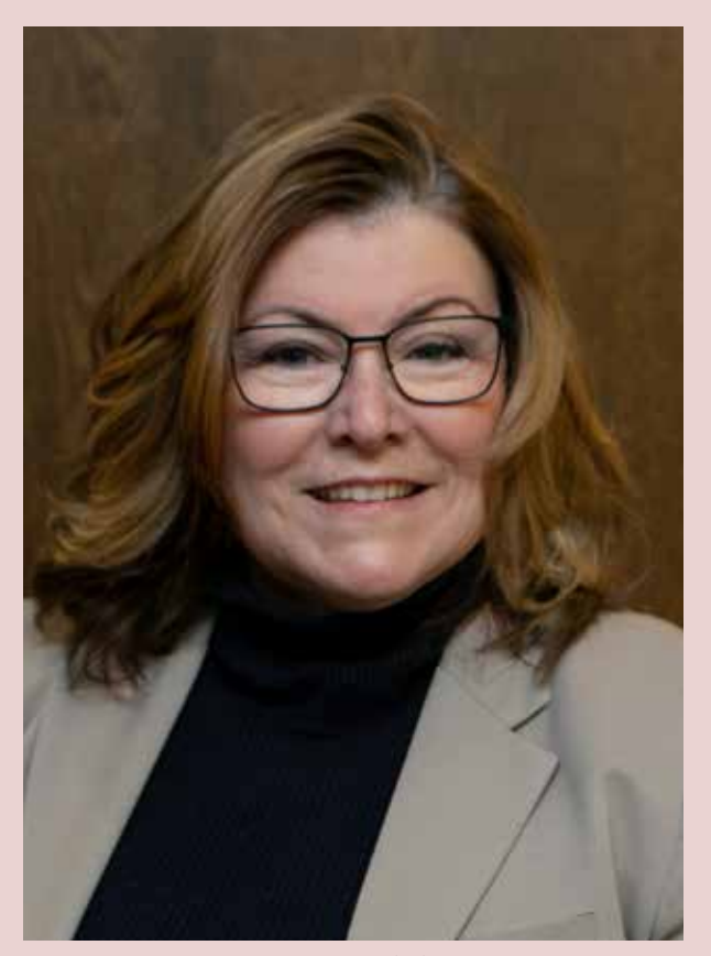
Mayor Loretta Gluckstein