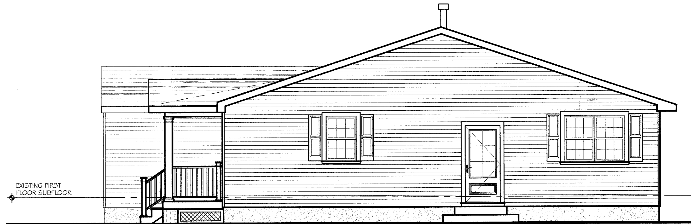
4 RIGHT SIDE ELEVATION SCALE: 1/4" = 1'-0"