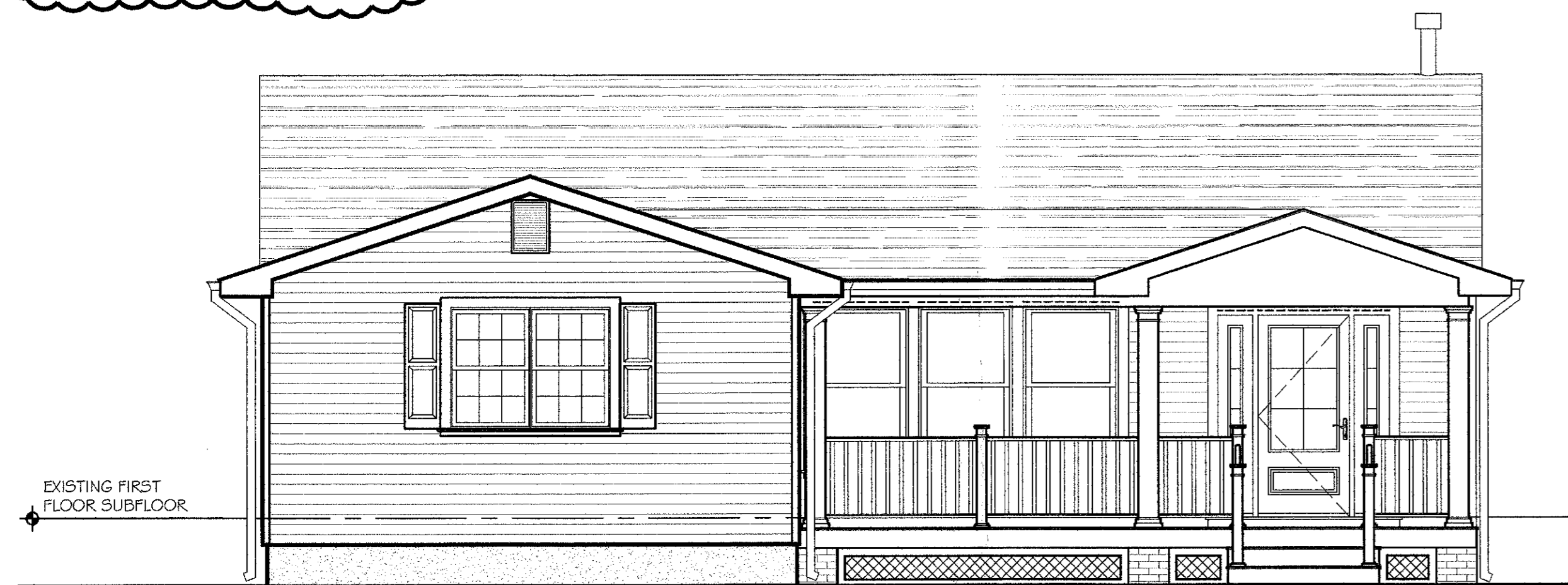
3 FRONT ELEVATION SCALE: 1/4" = 1'-0"